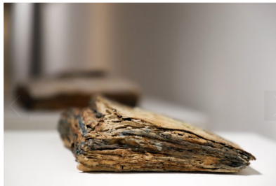
Lithified Lives, Savia Mahajan.