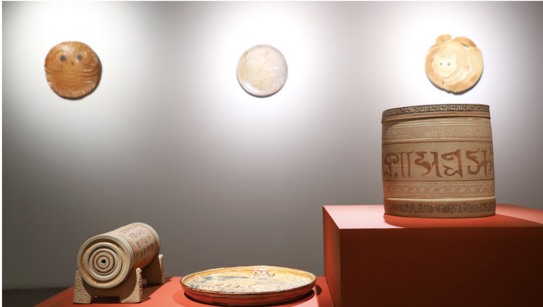
Installation Shot, Various Artists